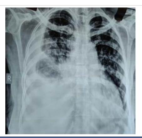
Figure 1: Chest X-ray showing right side pleural effusion and bilateral heterogenous opacities

CT scan of abdomen showed a 17.7 x 13 x 7.9 cm abdominopelvic heterogenous mass with clear borders without lymphadenopathy was observed. The patient underwent a hysterectomy and bilateral oophorectomy. A solid- cystic smooth surfaced and highly vascular mass dependant of both right and left adnexa. Scanty amount of peritoneal fluid was present. The intraoperative pathology of mass was suggestive of ovarian fibroma. Few months later, the patient reported no symptoms, had normal lung sounds, and a normal chest X-ray (Figures 1,2).