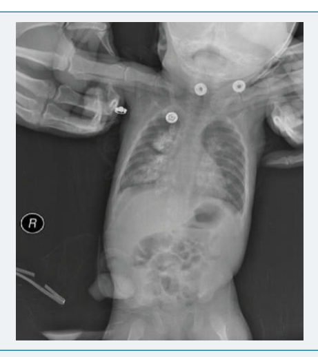
Figure 1: Application to the hospital, hyperdense areas especially in paracardiacareas.

Approximately three months ago when the infant was one month old that found out pharyngoesophageography with barium was taken at the external center due to swallowing problems and during the examination understood that the contrast matter extended to the trachea (Figure 2). It was learned that the patient who had been previously operated because of necrotizing enterocolitis. Before one week of the barium esophagografy that the patient reoperated in consequence of partial stenosis