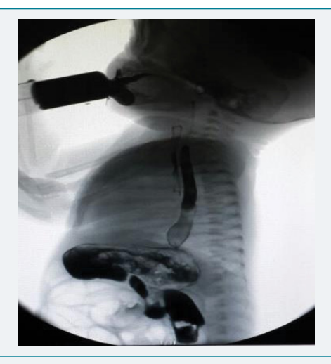
Figure 2: Esophagography: During the examination, it is understood that the contrast medium extends to the trachea.